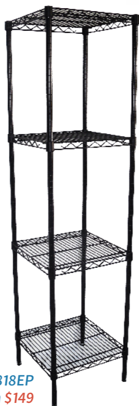
Code: SH1818EP 457 x 457mm $149