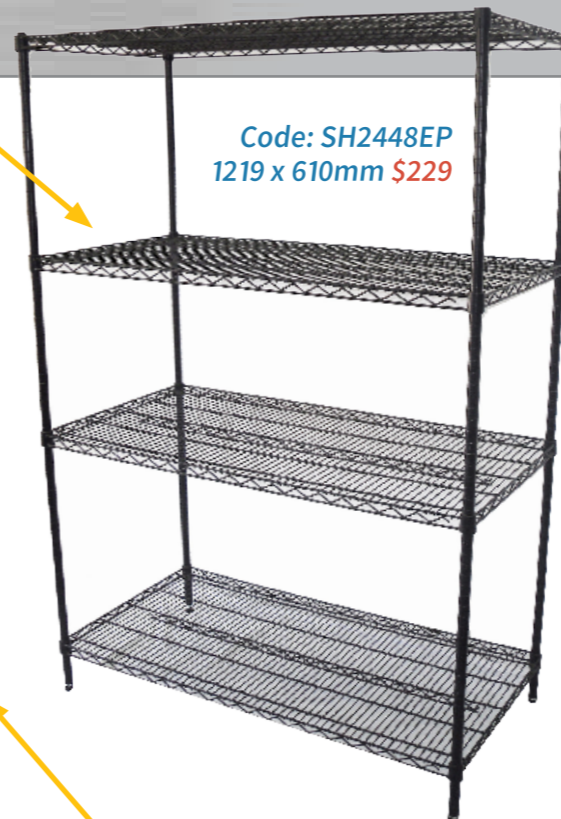
Code: SH2448EP 1219 x 610mm $229