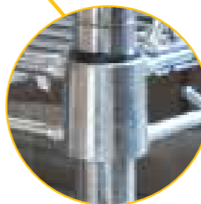
Our special black clip clicks under the shelf. Stops the shelf from sliding down - strong!