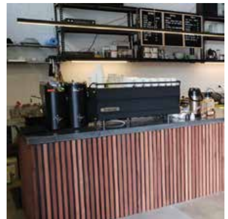
Enclose a bench to create a counter.