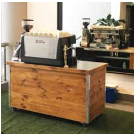
Enclose a bench to create a mobile coffee cart.