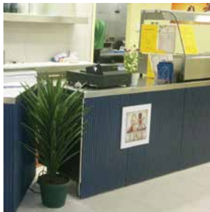
Enclose a bench to create a servery.